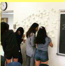
Affinity Mapping HSIP July 2019

After several weeks of HSIP we want students to spend time reflecting about how they feel their perception of the health sciences field has evolved. Students will reflect on what they learned from the speakers as well as from the group project. Students will then also consider the educational goals and professional aspirations they wish to pursue in the health sciences. We will utilize a unique discussion style known as "affinity mapping" to create a collective picture of what HSIP students are thinking. We will then discuss how their current perception differs from when they began the program.