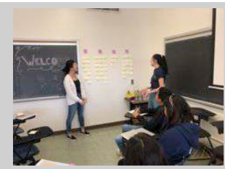
Leadership Workshop HSIP July 2019

One of the most well-received workshops during Summer 2019 HSIP involved students considering their own mission statements and how they could best communicate these to others, like a future employer. During this workshop, students will practice their interview skills, develop and elevator pitch and formulate a STAR story. They will practice delivering these pitches to each other and use the opportunity to gain constructive feedback.