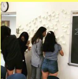
Affinity Mapping HSIP July 2019

After several weeks of HSIP we want students to spend time reflecting about how they feel their perception of the health sciences field has evolved. Students will reflect on what they learned from the speakers as well as from the group project. Students will then also consider the educational goals and professional aspirations they wish to pursue in the health sciences. We will utilize a unique discussion style known as “affinity mapping” to create a collective picture of what HSIP students are thinking. We will then discuss how their current perception differs from when they began the program.