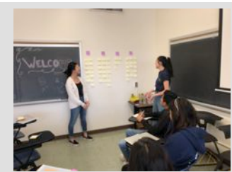
Leadership Workshop HSIP July 2019

One of the most well-received workshops during Summer 2019 HSIP involved students considering their own mission statements and how they could best communicate these to others, like a future employer. During this workshop, students will practice their interview skills, develop and elevator pitch and formulate a STAR story. They will practice delivering these pitches to each other and use the opportunity to gain constructive feedback.